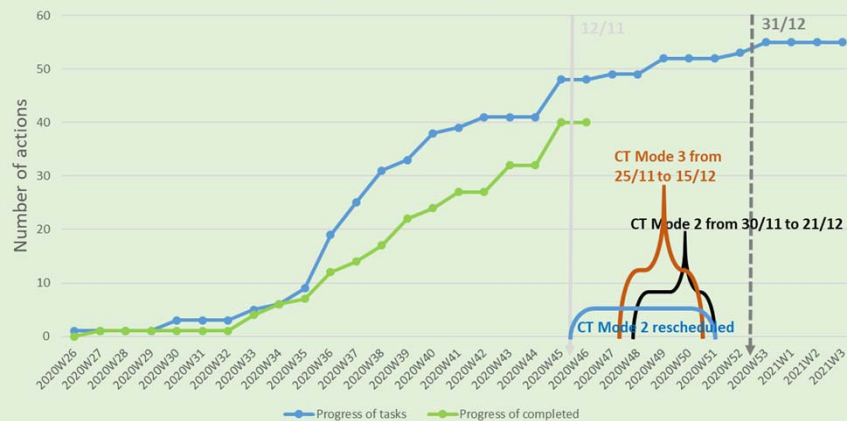
Status of Completed Actions per week - ECS - XI